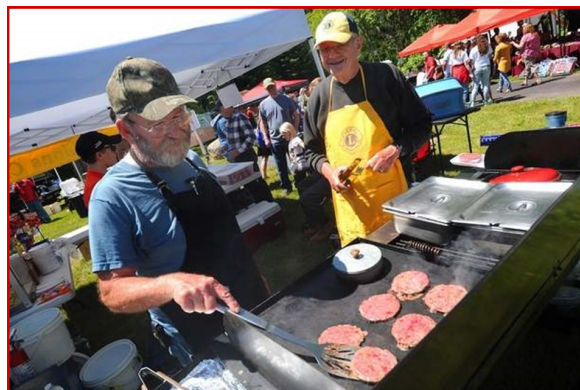
Hard working cooks at the June Fest 2017!